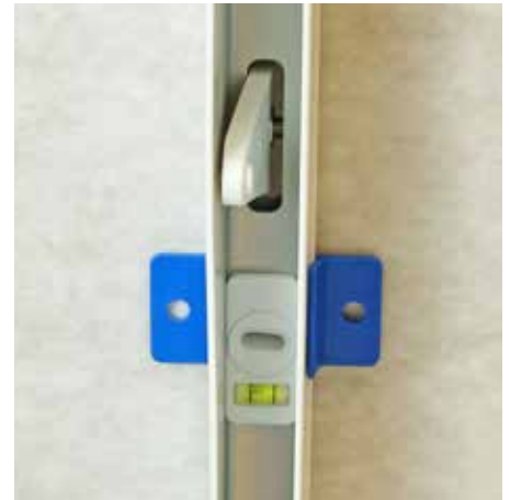
Door marking jig with built in spirit levels: facilitates optimum drilling and alignment points for perfect installation