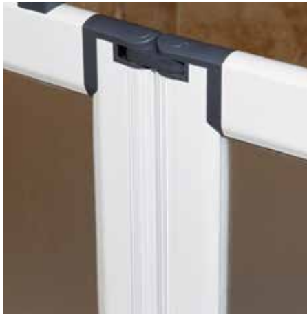
360 degree full length interlocking meshing seals allow the doors to be folded in any direction

Our folding doors are feature laden for your benefit.