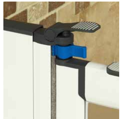
Transit clip to reduce risk of damage during carriage

An Autumn UK fitting kit is supplied, free of charge, with every door set.