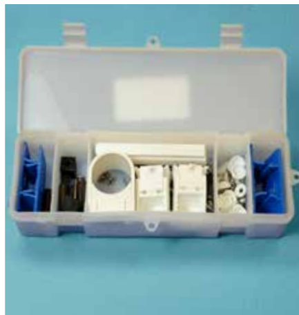
Bespoke, comprehensive fitting kit containing all components