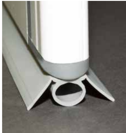
Three stage seal ensures a compression fit to optimise performance