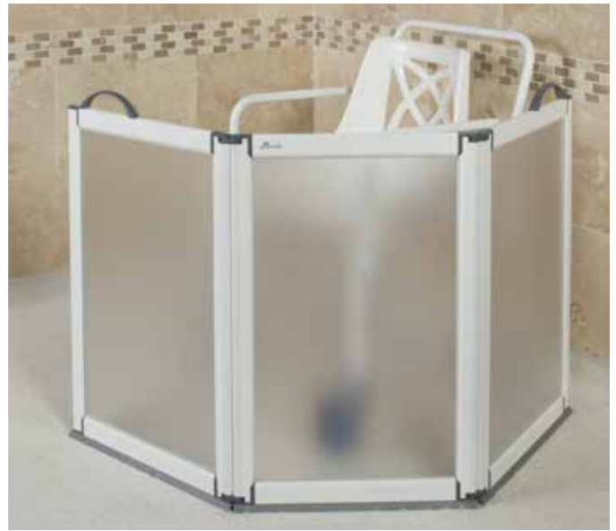
3 panel Easi-Screen

Easi-Screens are constructed with the same attention to detail as the wider door range and are 750mm high.