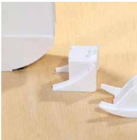
Patented cove profiles to ensure best fit