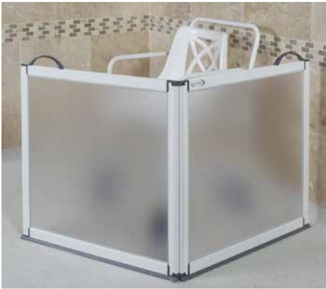
2 panel Easi-Screen